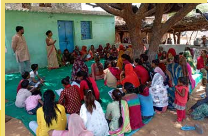
Beneficiaries selection in new villages of project geography.

The combination of these tools ensured a holistic understanding of the community's dynamics, enabling the project supported by La Caixa to tailor its interventions effectively. By actively involving community members in the process, the project promotes collaboration, empowers local entrepreneurs, and fosters sustainable development in both agri and non-agri sectors.