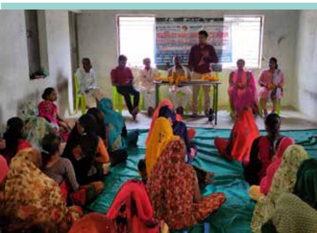
RSETI capacity building training organized for women farmer entrepreneurs.

The synergy between BCFRC and Agri Junctions forms a holistic support system, encompassing processing, storage, and community engagement. This integrated, collaborative approach contributes to the resilience of the local agricultural ecosystem