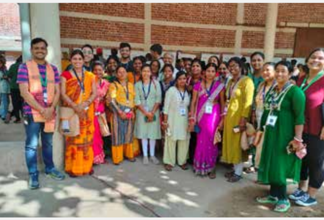
Participants of Jagriti StartUp G20 2023 Yatra

+ The Jagriti StartUp G20 2023 Yatra brought together a diverse group, including 10 women entrepreneurs from 4 districts of Uttar Pradesh, supported by Development Alternatives (DA) and its partners Swami Vivekanand Shiksha Samiti and Transform Rural India. These women, nominated as 'Changemakers' by the Bill and Melinda Gates Foundation (BMGF) and Uttar Pradesh State Rural Livelihood Mission (UPSRLM), had the opportunity to participate in this once-in-a-lifetime tour across India.