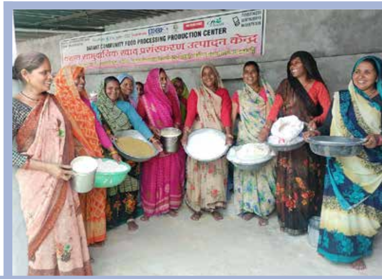
Women Farmers Leading Basant Processing Unit

The Agri Junction, as an enterprise prototype, serves as a crucial link between FPO and farmers. It operates as a focal point for farmers to access vital information, low-cost agri-inputs, and various resources directly within their villages. This prototype addresses the immediate needs of farmers, ensuring a streamlined connection between larger systemic goals and the ground-level realities. BCFRC and Basant Community Processing Unit represent additional enterprise prototypes that complement FPO's vision. BCFRC functions as a decentralized resource centre, disseminating agri-based information at both district and village levels. This prototype facilitates communication and cooperation among farmers while supporting the Basant Community Processing Unit in expanding its market reach.