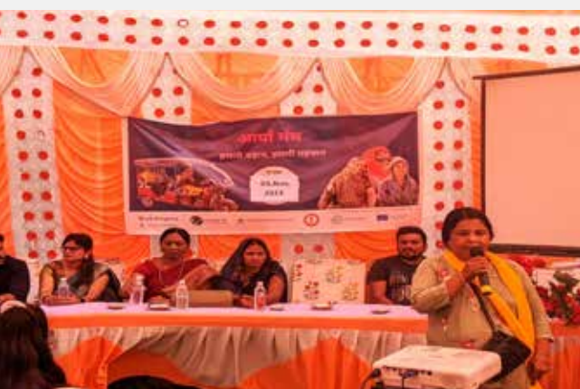
Launch of Aarya Manch in Mirzapur

+ A dedicated Coalition for e-mobility, ' Aarya Manch ,' was launched on September 5th 2023, to strengthen the exchange between entrepreneurs and ecosystem stakeholders like local self government authorities, Regional Transport Office (RTO) officials, police officials and e-rickshaw vendors. The second edition on November 3, 2023, drew over 100 participants, featuring discussions, lectures, and a street show to support women in e-mobility, with involvement from diverse stakeholders and e-rickshaw entrepreneurs.