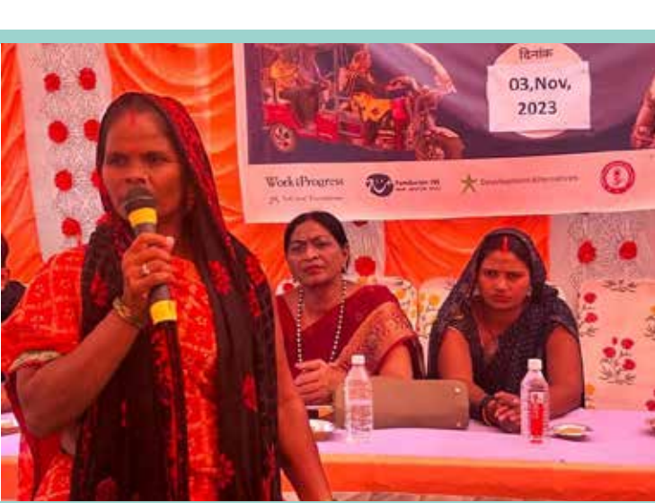
e-Rickshaw entrepreneur raising her concerns in Aarya Manch

The women-led e-rickshaw prototype of Development Alternatives (DA) was co-created with aspiring women entrepreneurs in 2018. During the reflection workshop organised to capture narratives from aspiring and existing women entrepreneurs, they revealed the common challenges faced by them in the e-mobility space.