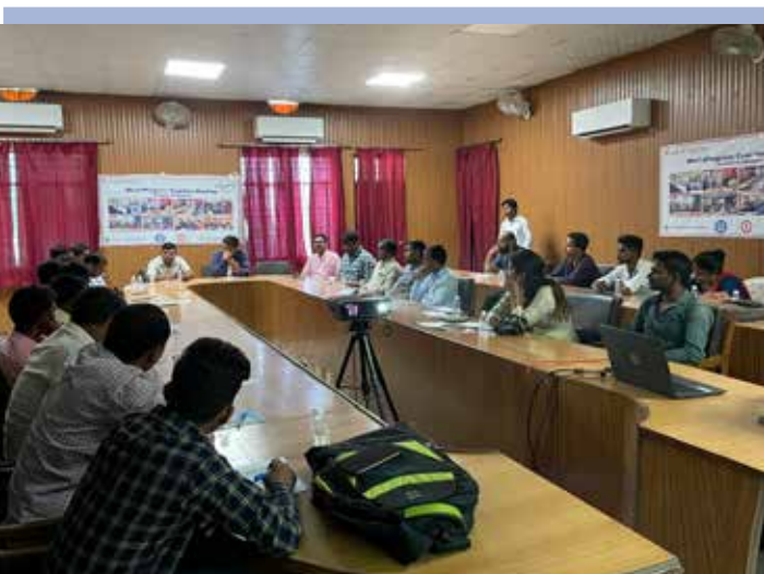
District Entrepreneurship Coalition conducted in Bhadohi, Uttar Pradesh.

The partnership with SBIF has been instrumental in fostering resilient and inclusive livelihood models, nurturing entrepreneurial ecosystems, and forging strategic collaborations. These efforts aim to enhance incomes and uplift marginalized communities, working towards breaking the cycle of poverty in these regions.