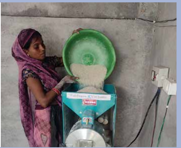
Flour making in basant processing unit.

The first ph The BASANT (Spring) Farmers Producer Organisation (FPO) is a systemic prototype legally registered to empower women entrepreneurs' farmers in the Bundelkhand region, Uttar Pradesh. Initiated in February 2022, this FPO is a unique prototype exclusively led by women, with an all-women Board of Directors. With a membership of 3000+ that continues to grow, the FPO operates as an overarching systemic prototype, orchestrating impactful initiatives through associated enterprise prototypes: Agri Junction, Basant Community Farmers Resource Centre (BCFRC), and the Basant Community Processing Unit. Our vision is encapsulated in the FPO's motto: "Empowering Women Towards Sustainable Livelihood."