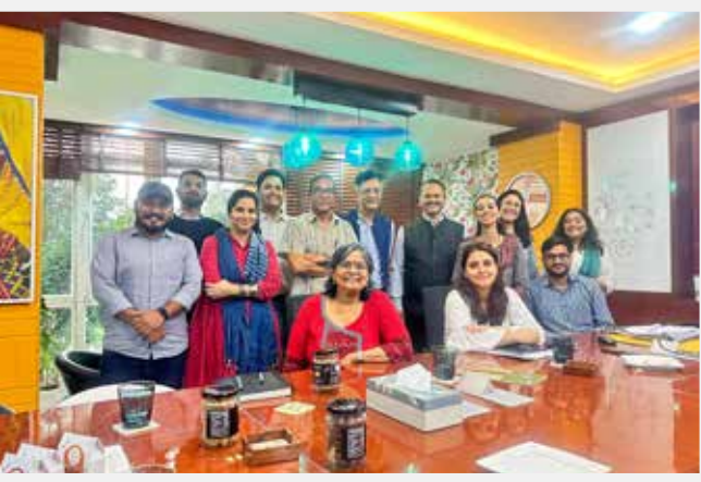
W4P India partners meeting at ACCESS's HQ

+ ACCESS Development Services (ACCESS) is the newest partner organization in the W4P India network. It is implementing the W4P Program titled ““Work4Progress India (Greenpreneurship: Mainstreaming Sustainable Livelihoods)” beginning from October 2023 in the two districts of Rajasthan i.e., Jaipur and Dausa. The project will reach out to support acceleration of 5 existing prototypes, 1 new prototype (Greenpreneur), 430 new jobs creation and supporting 2,338 existing jobs within 18 months.