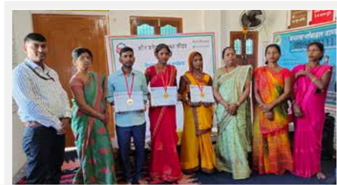
Winners of digital KBBL being felicitated at Varanasi

+ Another chapter of Kaun Banega Business Leader (KBBL) has been rolled out in Ghazipur and Varanasi, Uttar Pradesh. KBBL has been digitised for the first time and piloted in partnership with Gram Vaani from July to September 2023, reaching over 15,000 listeners and receiving 133 diverse business ideas from the community. Out of the business ideas received, 15 were shortlisted and top 3 were felicitated at the KBBL final event held in Varanasi on October 20, 2023.