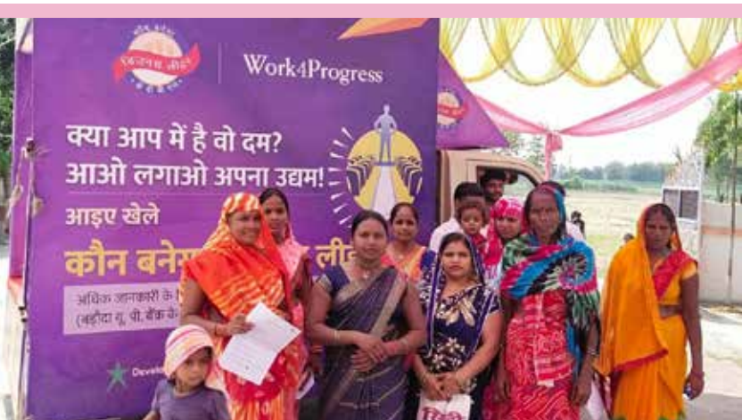
Participants from the KBBL competition conducted by TRI in Basti, Uttar Pradesh

The W4P programme, undertaken in partnership with Development Alternatives, plays a pivotal role in supporting these endeavors. Under this initiative, various government departments, Civil Society Organisations (CSO), bankers, training institutes, and market players were actively involved during coalition meetings. This has helped to foster a collaborative spirit that serves as the driving force behind entrepreneurship.