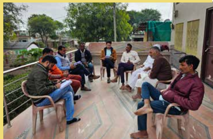
Focus group with men in Rajasthan