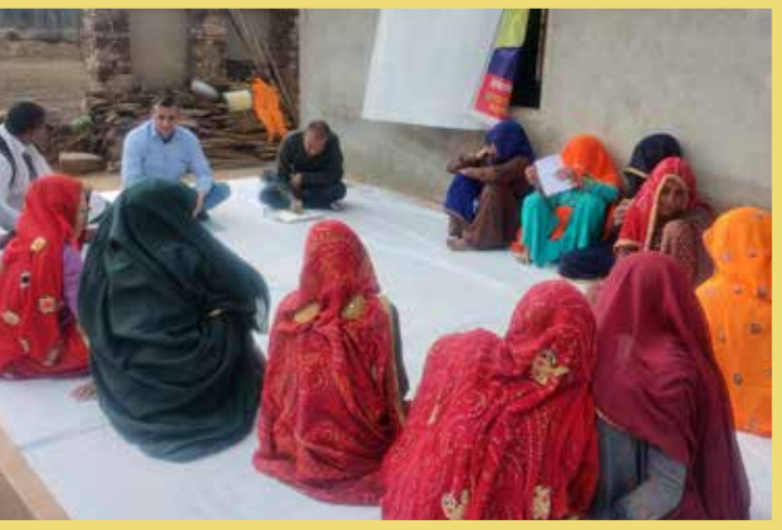
Focus group with women in Rajasthan

The ACCESS team met some of the nodal government officials at state, district and block levels. The team held a meeting with Watershed Development & Soil Conservation officials at Jaipur to orient them about the project and understand key interventions of the watershed department in selected project blocks. The team also met the Block level government officials from agriculture and animal husbandry departments to brief them about the project and take their suggestions with respect to relevance of selected blocks and preferred villages. This preliminary engagement with the nodal government departments is helping to build a rapport with them and in incorporating the government. schemes and interventions in selected project geographies. The team hopes to leverage this to build collaborative interventions in the coming months.