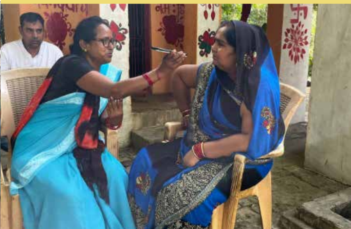
Women entrepreneur during the training session by Gram Vaani.

Several participants shared their business ideas through udyame Vaani, of which 15 ideas were shortlisted along with 4 other aspiring entrepreneurs who shared their detailed business plans of setting up their enterprises. These people were honoured at an event, where they shared their experience of using udyame Vaani and how they were influenced and motivated by it.