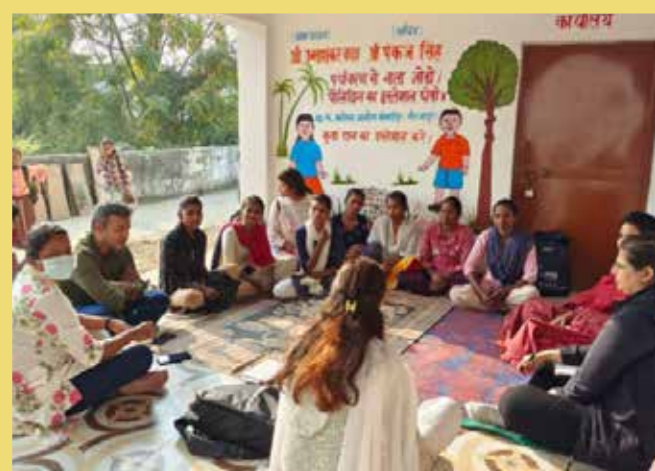
Listening session underway at Kantit Gramin, Mirzapur District in Uttar Pradesh

Growing aspirations for local livelihood opportunities: Through the process of re-listening, it has been observed that there is a continuous loop of listening and learning to unearth a deep understanding of the enablers, the opportunities and prospects of collaboration among stakeholders. A responsive entrepreneurial ecosystem has also emerged, reflecting a scope for scaling entrepreneurship in the program geographies.