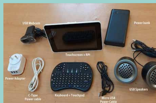
ASPi device components

Integration from ecosystem building: Leveraging technology can further help create a 'thick data' repository to develop a contextualized database of knowledge of existing entrepreneurs that can be deployed to aid others in their journeys. Sharing of these resources within the network can influence critical financial flows back into the programme as well as analyze emergent voices within and across the ecosystem.